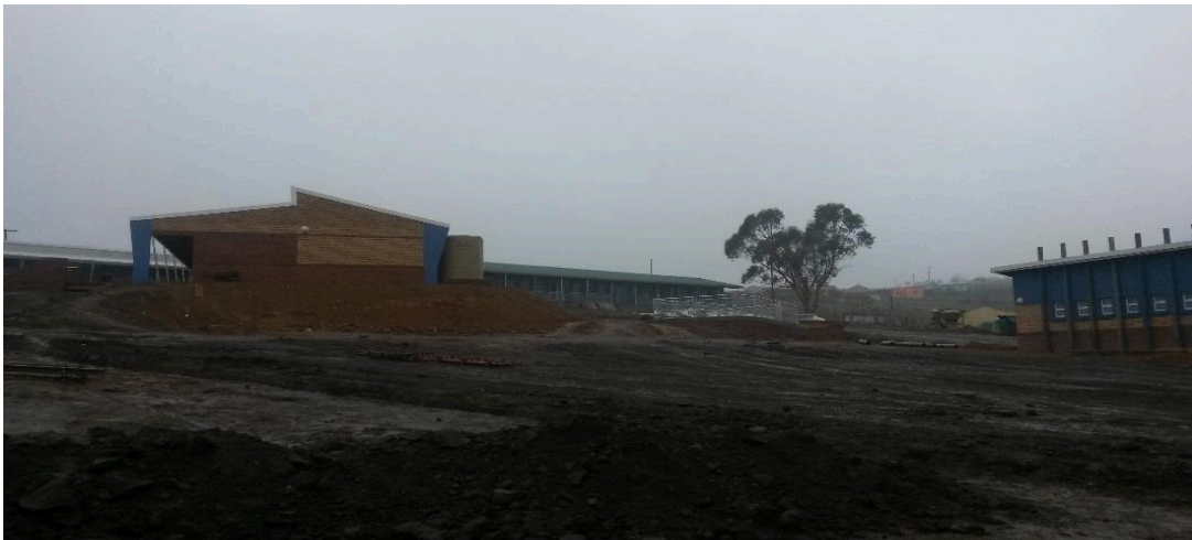
Smuts Ndamase: Construction of new Senior Secondary School – Eastern Cape Value: R59 852 685.00